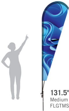
131.5" H Medium Teardrop Flag FLGTMS