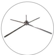
Heavy-duty X-base for indoor or flat surface environments