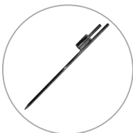
Coated-steel rotating spike with stainless steel bearings for in-ground application