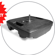
A durable, fillable base designed to keep your flag securely in place.