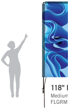
118" H Medium Rectangle Flag FLGRMS