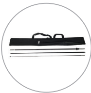
Durable fiberglass-graphite composite pole set with carrying case

Single-sided printing is visible on both sides (mirror image on the back). Double-sided printing ensures that the graphics on both sides read properly.