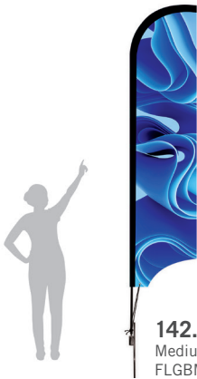
142.25" H Medium Blade Flag FLGBMS