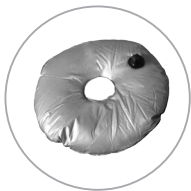
Water bag to provide additional weight (for use with X-base)